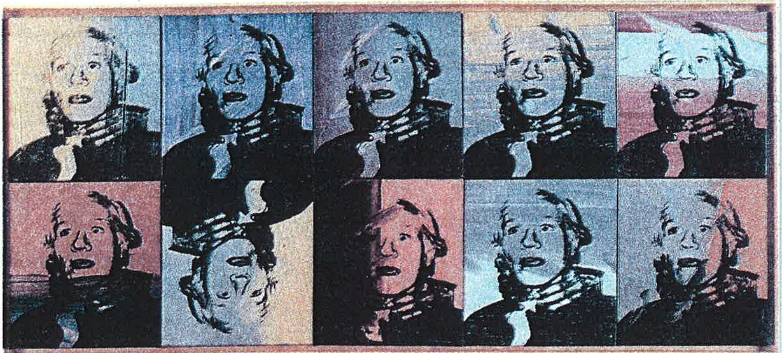
ANTHONY D'OFFAY, ANDY WARHOL FOUNDATION FOR THE VISUAL ARTS/ARTISTS RIGHTS SOCIETY, NEW YORK

"Self-Portrait (Strangulation)," a richly brushed grid of canvases by Andy Warhol in 1978.